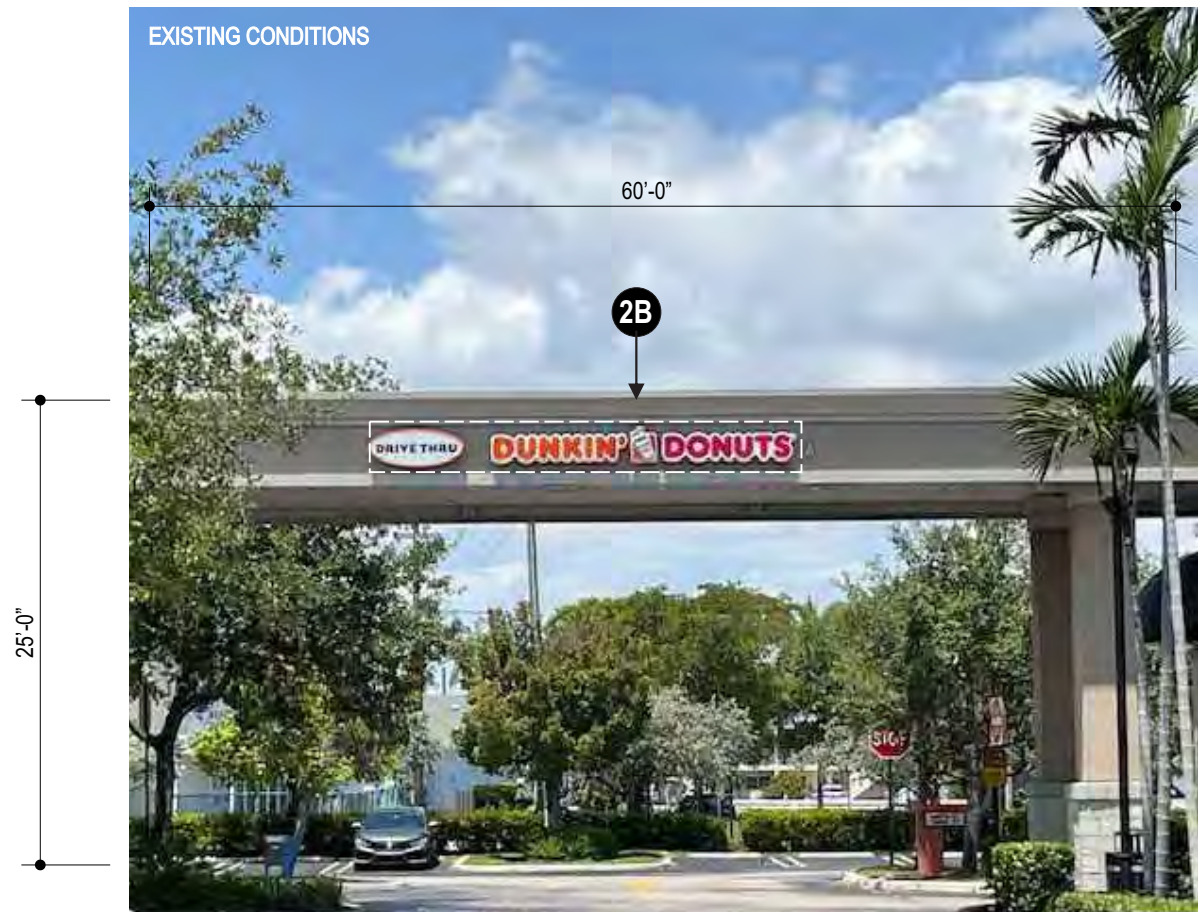
2B EAST EXTERIOR ELEVATION SCALE: 3/32" = 1'-0"